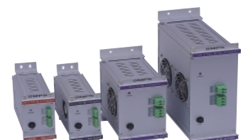
SMPS POWER SUPPLIES