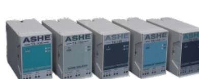
SIGNAL ISOLATORS & TRANSDUCERS