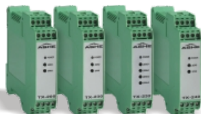
SIGNAL ISOLATORS & TRANSDUCERS