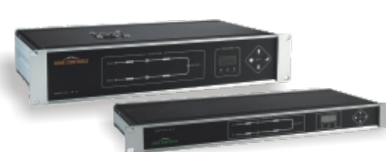
STATIC POWER SWITCHES