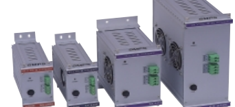
SMPS POWER SUPPLIES